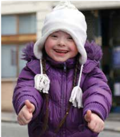
What if I was never born?