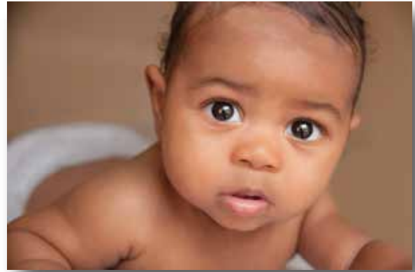
What if I was never born?